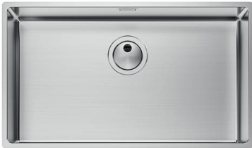
Sink S4001 3138 850