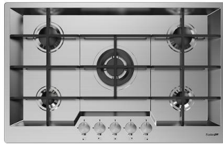
Cooker hob KE 7602 032