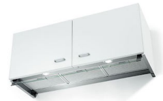
Hood New Wing 2512 072